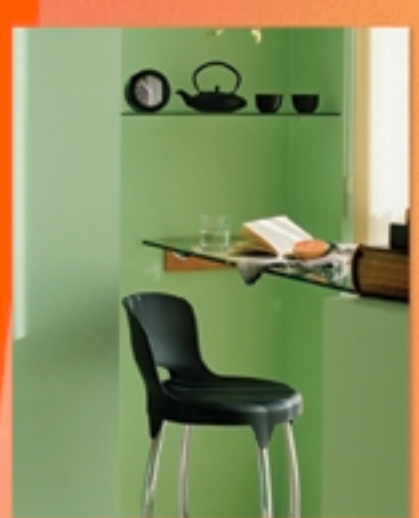
PRODUCE COLOUR THAT LASTS UP TO 25 YEARS<sup>2</sup>

GET HIGH SPEED, HIGH DEFINITION PHOTO PRINTS